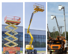
A scissor lift (left), a cherry picker (middle), and a bucket truck (right).

An aerial lift can prevent falls and reduce the risks for back, neck and shoulder injuries caused by working at or above shoulder level by positioning you where you need to work.